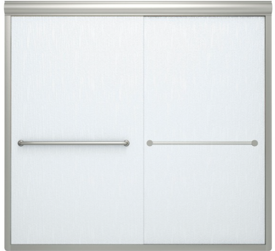
Model L0054 shown