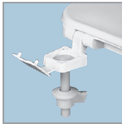
NON-CORROSIVE BOLTS AND WING NUTS