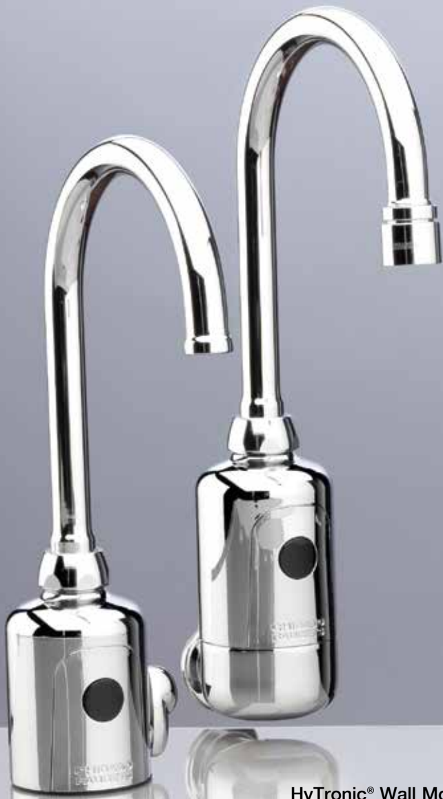
HyTronic® Wall Mount