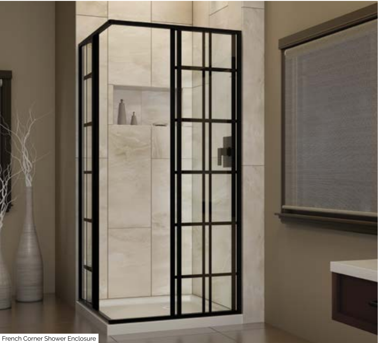
French Corner Shower Enclosure

*For additional information and product options please refer to the Shower Base, Backwall and Kit Catalog