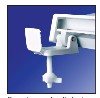
Corrosion proof, self-aligning hardware