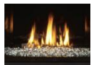
Glass burner kit