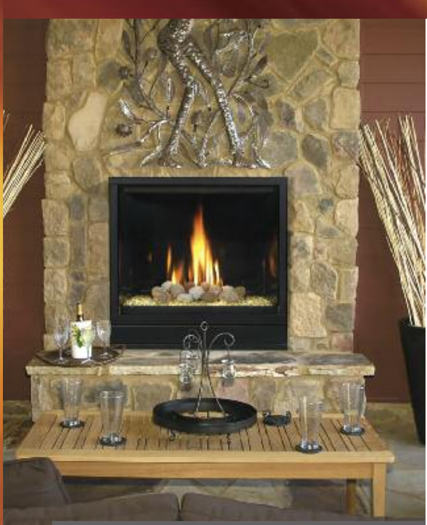
300DVBL direct vent fireplace system with stone and glass burner kit