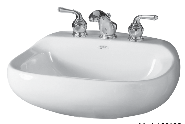
Model 2018C (Less faucet, drain assembly and supply)