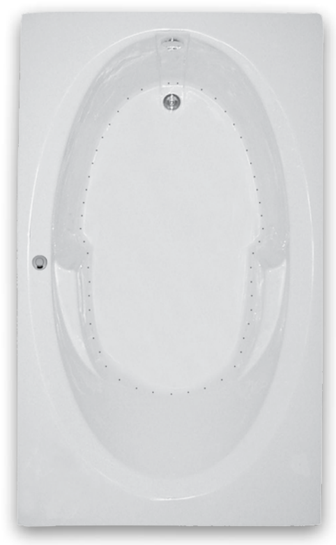
Model 6727 (Shown withmetal air switch and Lift and Turn drain)