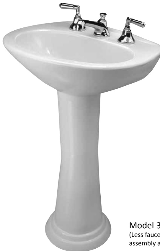
Model 350-4 (Less faucet, drain assembly and supply)