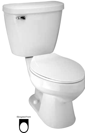
Model 382-386 Toilet seat not included