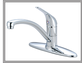
#2LG160H SHOWN * ADA