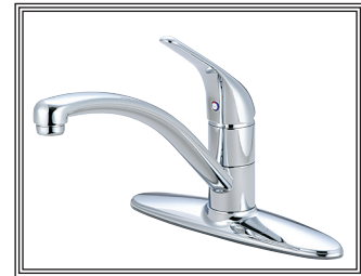
#2LG160 SHOWN * ADA