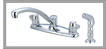
#2LG111 SHOWN * ADA