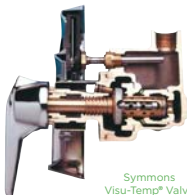
Symmons Visu-Temp® Valve