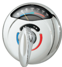
Symmons Visu-Temp® with Clear Vue™