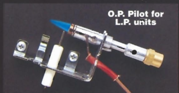
O.P. Pilot for L.P. units