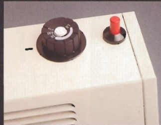
VFT/BFT Top Control