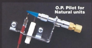
O.P. Pilot for Natural units