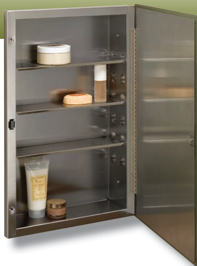
S-cube 868P24SS Solid stainless steel construction Stainless steel shelves Beveled mirror