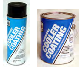
PREMIUM INTERIOR COATING