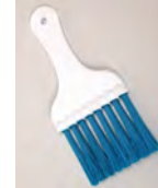
COARSE COATING BRUSH