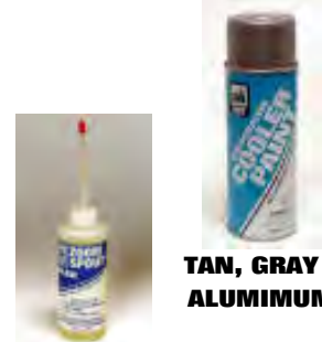
TAN, GRAY & ALUMINUM