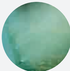
Without Pressure Regulation

Toro's factory-installed pressure regulator eliminates water misting and fogging at the nozzle that can lead to rapid evaporation or water being blown away from the intended irrigation area. From the first to the last head, the in-stem pressure regulator provides a steady outlet pressure of 30 PSI and consistent spray head performance across the zone.