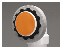
Includes built-in test membrane