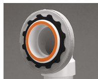
Easily remove membrane after test