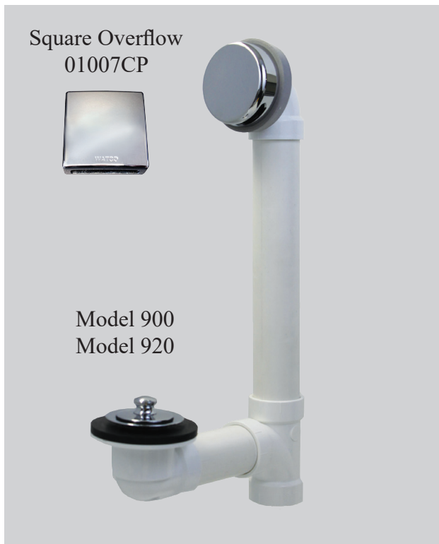
Square Overflow 01007CP