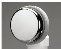
Snap-on overflow plate. No screws

See price list for complete item numbers and available options.