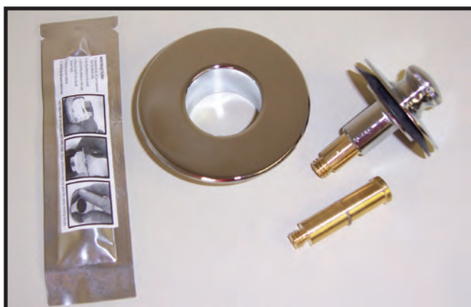
▲ Model 48600: NuFit® PUSH PULL® Tub Closure

See price list for complete item numbers and available options.