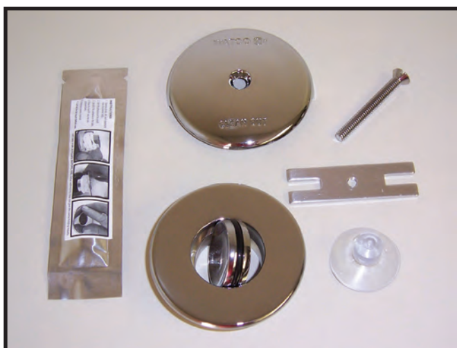
▲ Model 48100: NuFit® PRESFLO® Trim Kit