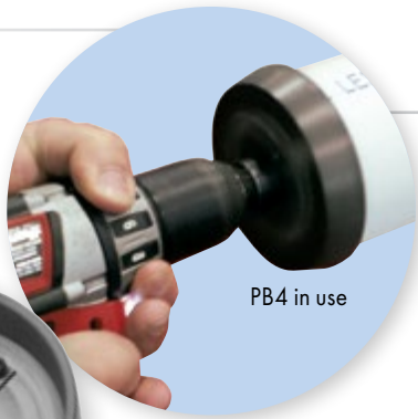
PB4 in use