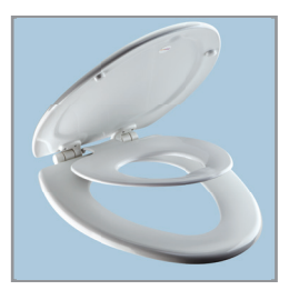
CHILD SEAT SECURES MAGNETICALLY INTO COVER WHEN NOT IN USE