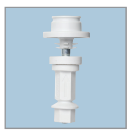
STA-TITE® SEAT FASTENING SYSTEM™