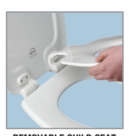
REMOVABLE CHILD SEAT