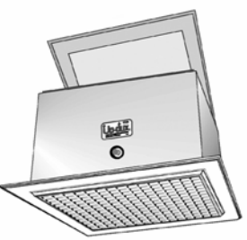
UP-DUX® See www.Up-Dux.com and catalog page 32