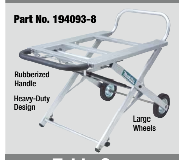
Table Saw Accessories