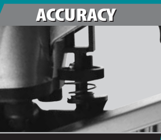
"Tool-less" depth adjustment with 9 settings allows user to drive nails to the precise level onthe wood's surface

Built-in air filter minimizes dust and debris, prolonging life and minimizing maintenance