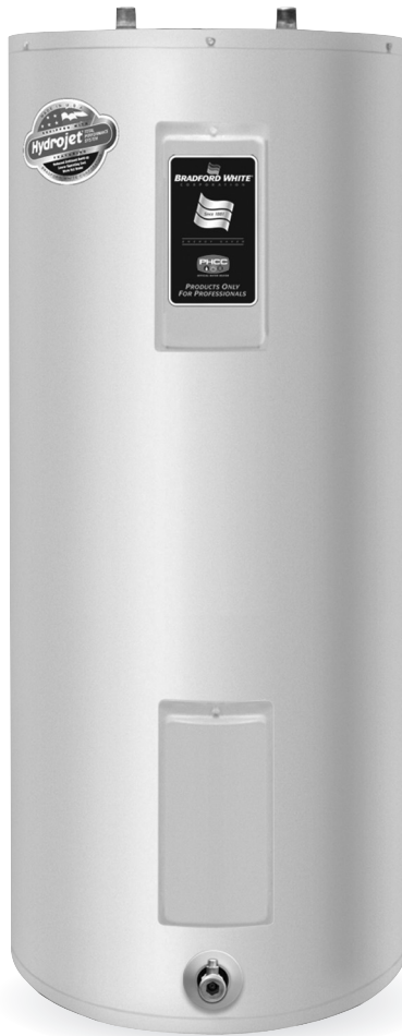
Photo is of RE250S6