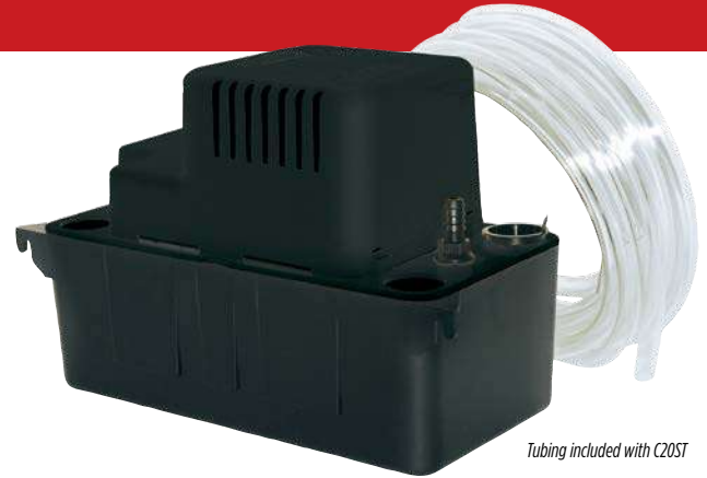
Tubing included with C20ST