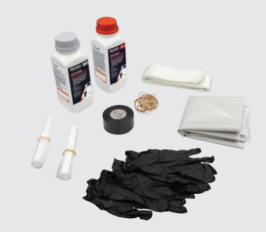
Catalog No: 74698