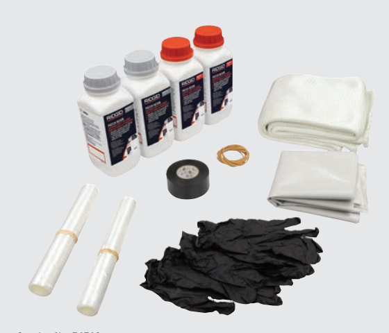
Catalog No: 74718