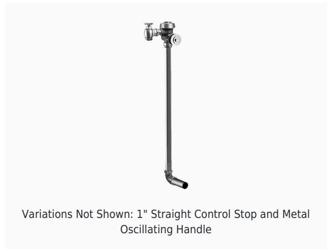
Variations Not Shown: 1" Straight Control Stop and Metal Oscillating Handle