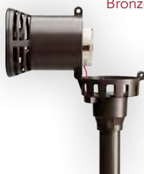
HVRFABR – Bronze

Child-resistant fixture opens with screwdriver for easy repellent cartridge replacement.