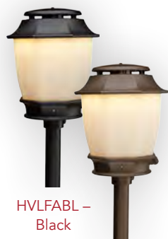
HVLFABL – Black