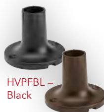
HVPFBL – Black