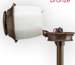
HVLFABR – Bronze

Child-resistant fixture opens with screwdriver for easy repellent cartridge replacement.