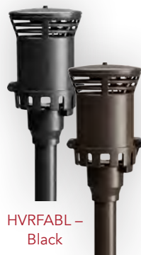
HVRFABL – Black