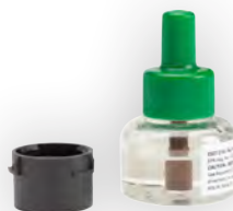
HVRC1 – Single Pack