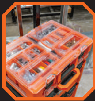
CLEAR LID Easily view contents for enhanced efficiency and quickly assess inventory