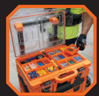
REMOVABLE BINS Organize small parts such as wire nuts, connectors, and fasteners